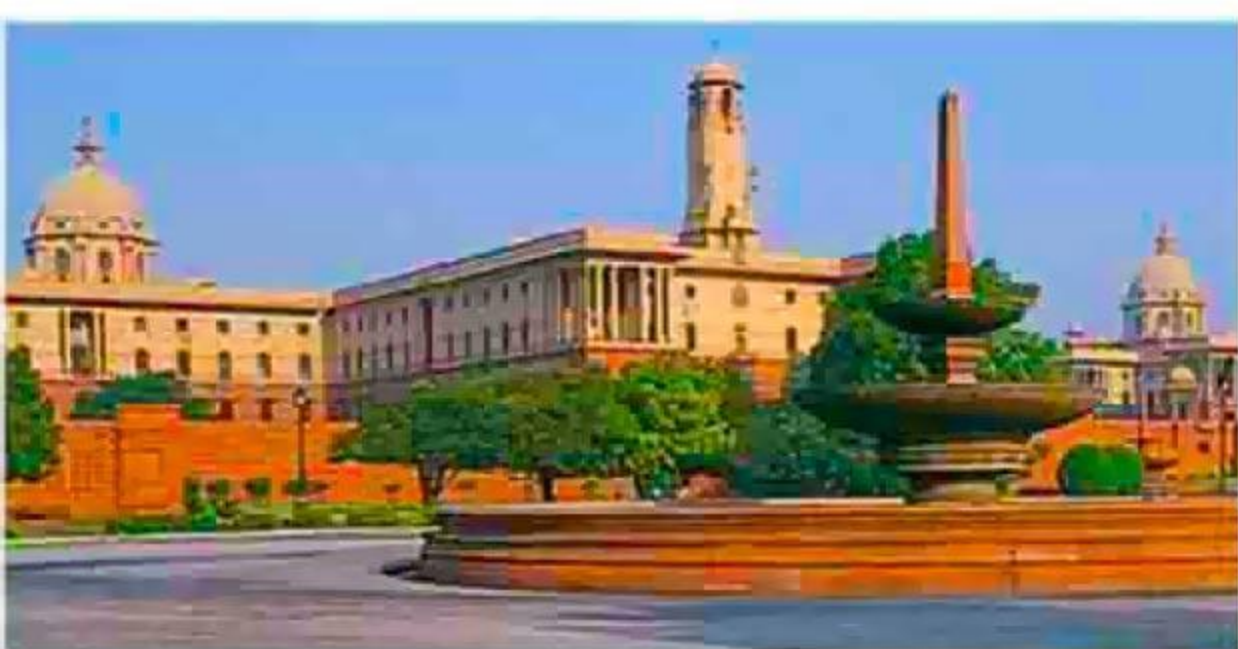
Vijay Chowk, at the base of Raisina Hill, surrounded by government offices

Some of Delhi's most impressive buildings can be seen in the area shown in this map. Vijay Chowk is the vantage point for the grand sweep of Raj buildings grouped on Raisina Hill. To the north, the magnificent Jama Masjid with its busy hive of lanes, is the focus of Old Delhi. To the southeast, the medieval quarter around the tomb of the Sufi saint Nizamuddin Auliya leads along Mathura Road to the ruined fort, Purana Qila. And to the south, the Mehrauli area (shown on the Greater Delhi map), has a fascinating cluster of monuments built in the 12th and 13th centuries.